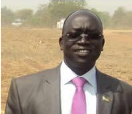
Hon. Hussein Mar Nyuot National Chairperson of the National Committee of Humanitarian Affairs, South Sudan Relief and Rehabilitation Agency, SSRRA – HQs, SPLM/A-IO

Former Deputy Governor of Jonglei and Current Chairman of South Sudan Relief and Rehabilitation Agency SPLM/A in Opposition